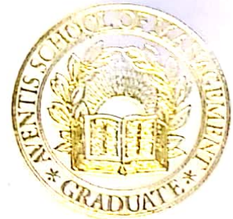
Academic Registrar Aventis School of Management