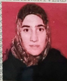
Photograph of the Bearer