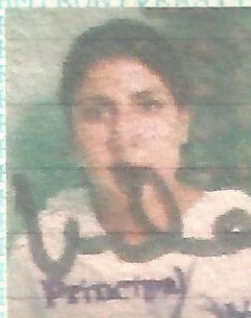
Photograph of the Bearer